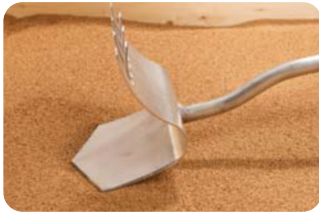
Tamp / Level