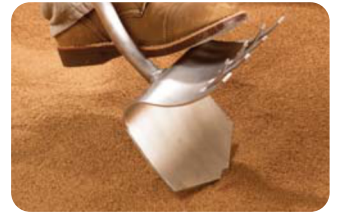
Excavate / Dig